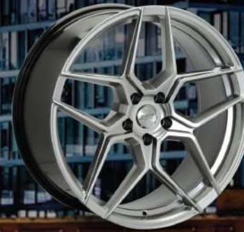
02 LE MANS

Finish : Gloss Black 18x8.5 | 9.5 , 19x8.5 | 9.5 , 20x9 | 10 Red decal optional extra