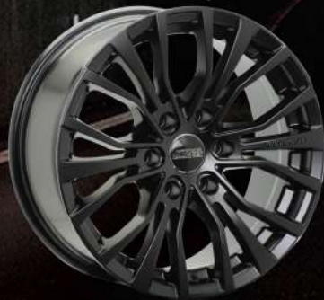
13 ULTIMATE II