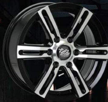
11 KARGIN II