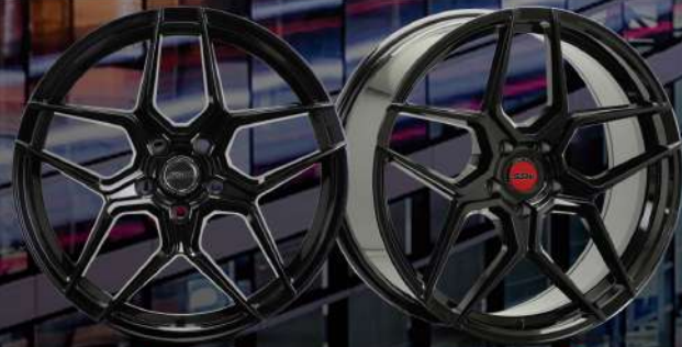
01 LE MANS

Warranty is not transferable and only for original owner on receipt.