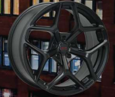
05 DOMINATE BIG BRAKES