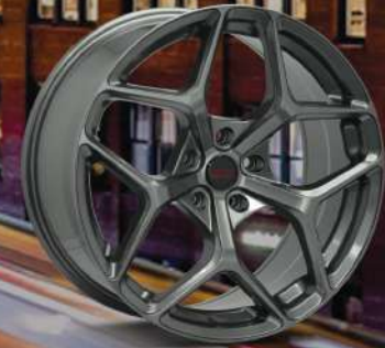
04 DOMINATE BIG BRAKES

Finish : Black Matt 18x8, 19x8.5, 20x8.5 | 9.5 | 10